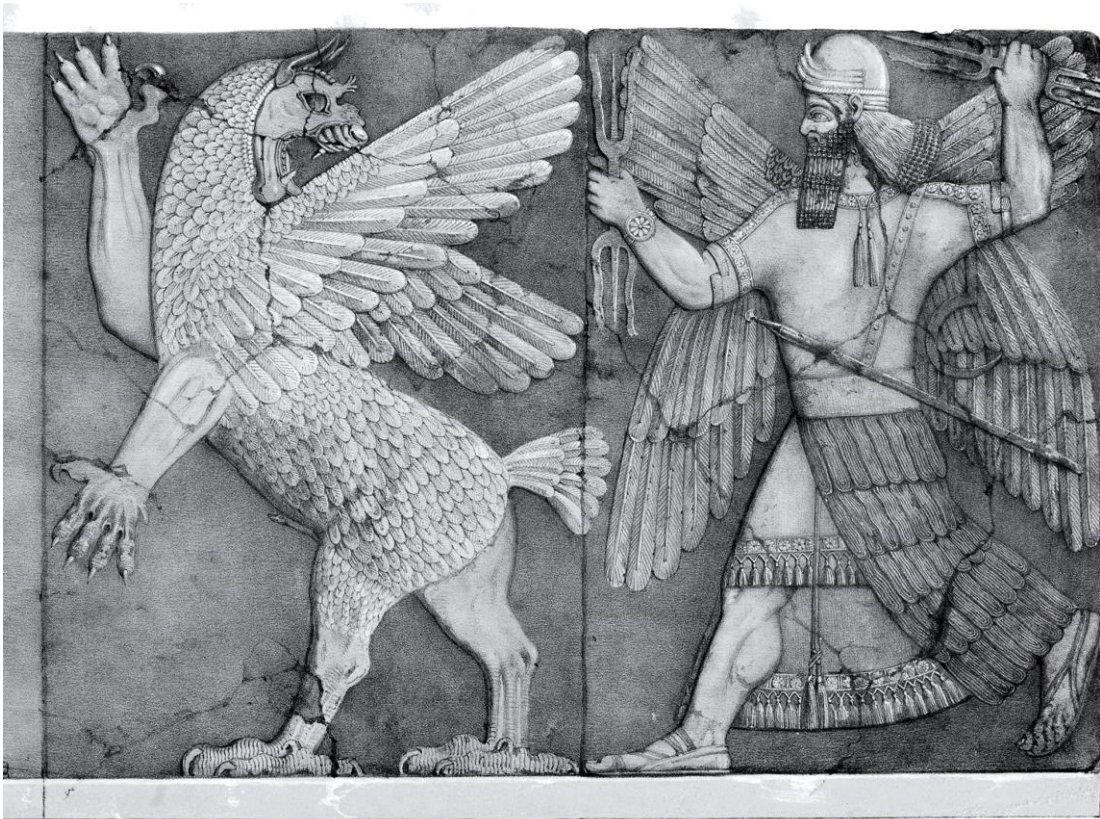
Atra-Hasis Chaos Monster and Sun God